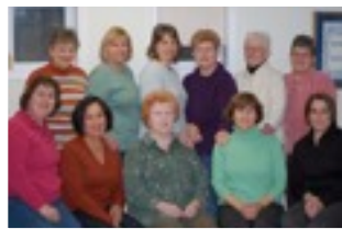
LADIES OF SACRED HEART BATAWA, ON. (Not all Ladies pictured)