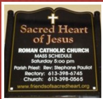
NEW SIGN FOR SACRED HEART WEB SITE: www.friendsofsacredheart.org