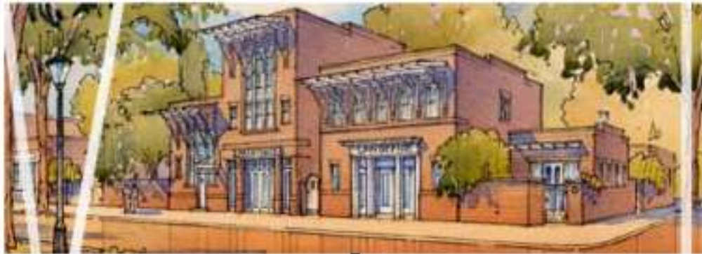
Live/Work 2001, Castleberry Hill, Atlanta (Duany Plater-Zyberk & Company)

Allowable business uses may include the following: