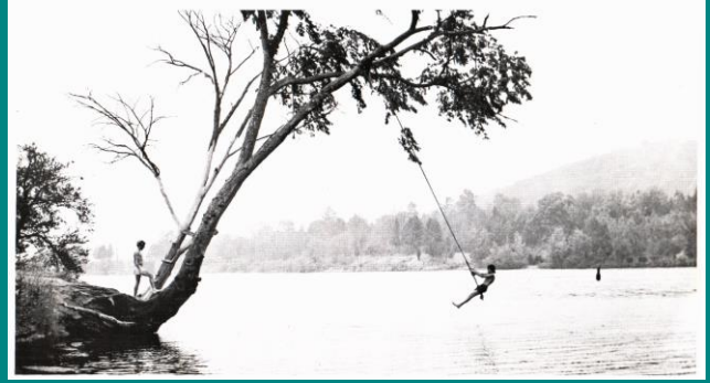
Young Batawa residents enjoy a summer dip in the Trent in this undated photo.

A long-time favourite swimming spot for Batawa residents was the Trent River just at the end of Parry Drive. The spot sits along the trail that follows the river, which was used by the Iroquois long before Samuel de Champlain even arrived. That historic trail is now the Loyalist Parkway, Hwy 33.